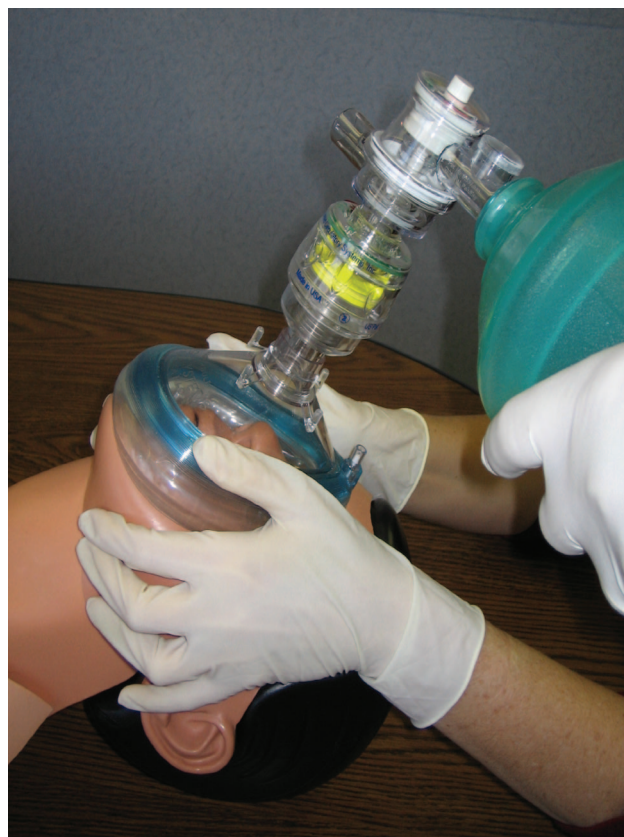
Fig. 1. Demonstration of the 2-handed technique in initial use of the impedance threshold device (ITD) with a face mask, maintaining a continuously tight seal during compressions and ventilations.

Data were collected prospectively at both hospitals and pooled together with the intent to publish the conglomerate data. At the time the study was proposed, the data from the 2 hospitals represented the largest controlled clinical experience with the new CPR techniques and ITD use. The primary end point was hospital discharge rate. Hospital-discharge data from the historical control phase and the intervention phase were analyzed separately for each hospital, and together. Data were compared using Fisher's